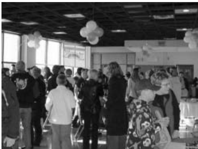
Alumni gather at a reception following game 2 at the CIAU Nationals in Kitchener