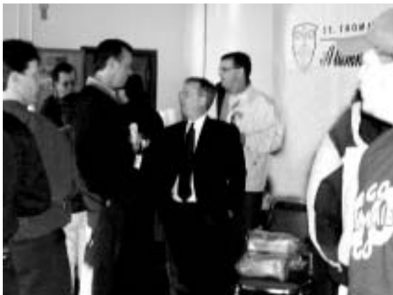
Former STU Tommies & friends gather to check on the hockey team at Nationals.