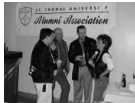
Alumni and friends gather to review the games.